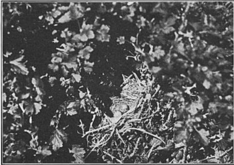
Fig. 49. NEST OF WHITE-CROWNED SPARROW IN WILD GOOSEBERRY BUSH; CYPRESS HILLS, SASKATCHEWAN, JUNE 18, 1919.