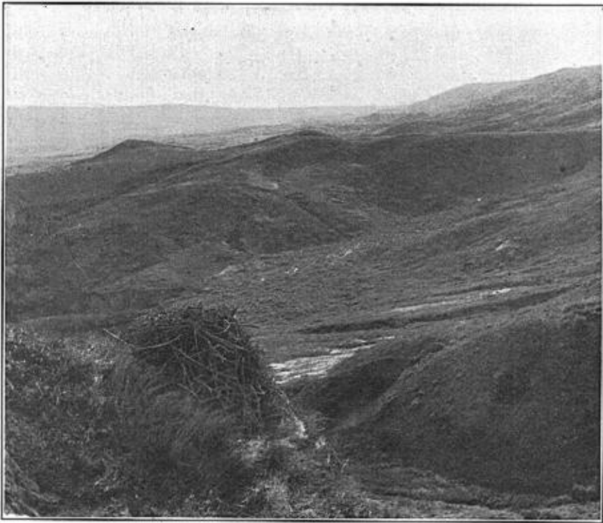
Fig. 47. THE SOUTH CYPRESS HILLS, NEAR EASTEND, SASKATCHEWAN; NEST OF FERRUGINOUS ROUGH-LEGGED HAWK IN FOREGROUND.