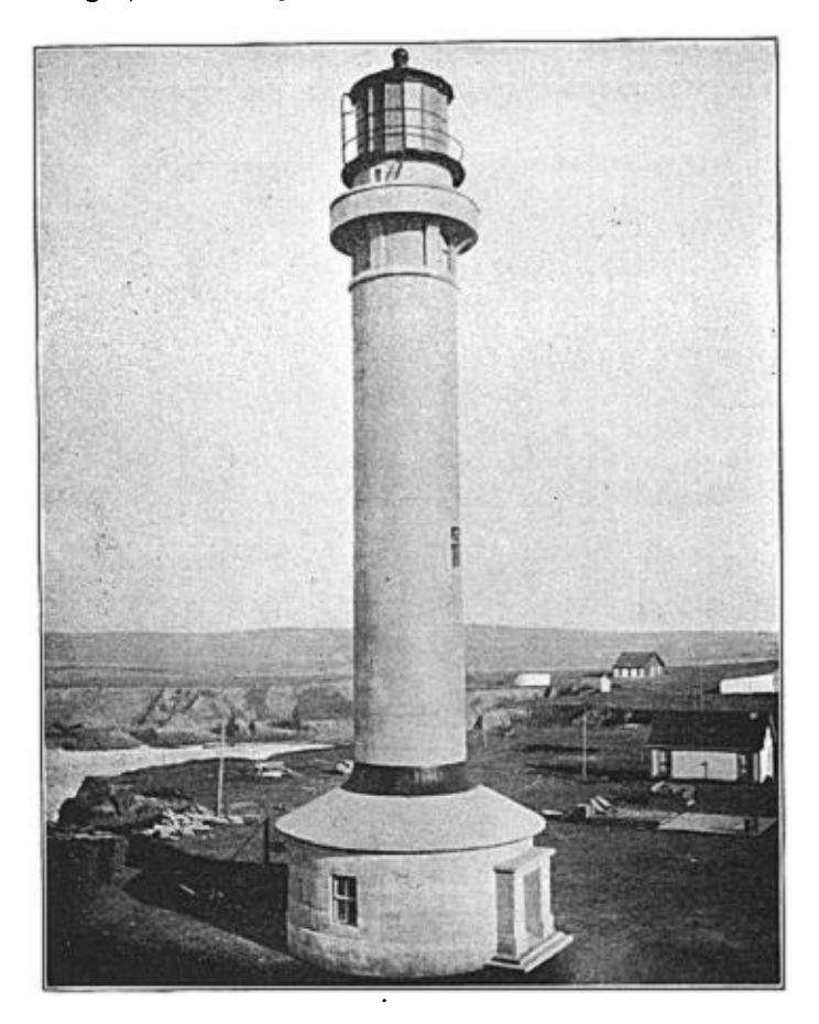
Fig. 2. Lighthouse at Point Arena, Mendocino County, California. The "brick chimney" type, whose great height makes it dangerous to birds. The light at this station is 155 feet above the sea, and the keeper reports from ten to thirty birds per night killed on calm, dark nights during the migration seasons.

The returns seem to indicate that the danger to birds increases in direct proportion to the distance of the lighthouse lantern above the ground, while the general elevation of the whole structure is also an important factor. Many of the lighthouses are situated near sea level and at the foot of high bluffs, and not one so situated reports any bird destruction. But where the lighthouse is located on a height, even though it be not very high itself, there is considerable