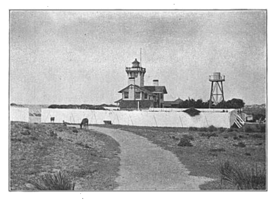
Fig. 3. Lighthouse at Hueneme, Ventura County, California. The low-built type of lighthouse which causes but slight destruction of birds, this particular station reporting only four birds found dead in three years.

IV. The greatest danger to the birds is evidently on dark overcast nights. The seasons of greatest danger are evidently during the spring migration and the autumnal migration, with less danger during the winter season and least of