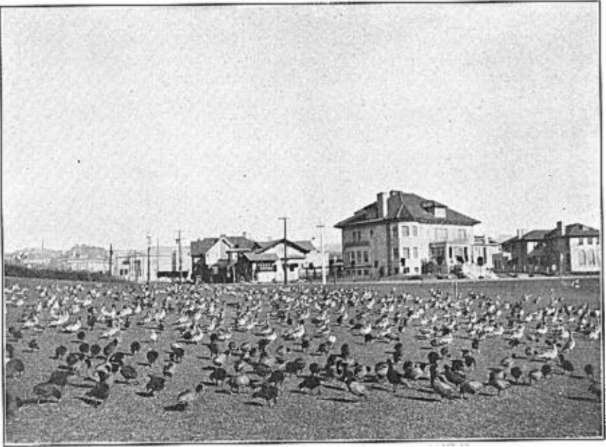
Fig. 33. SPRIG, BALDPATE AND COOTS FEEDING ON THE LAWN.