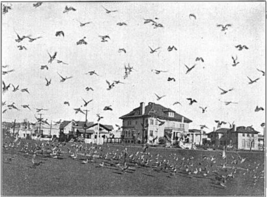
Fig. 35. SAME FLOCK AS IN FIGS. 33 AND 34. THERE IS A LIMIT TO THE TRUSTFULNESS OF EVEN VERY TAME WILD DUCKS AND PHEGMATIC MUDHIENS.