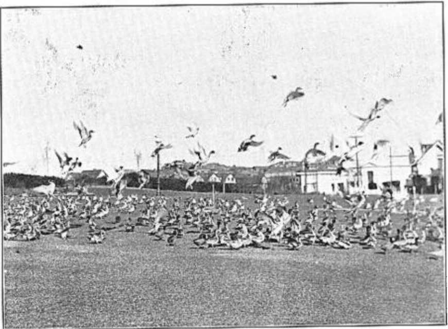
Fig. 34. SAME FLOCK AS IN FIG. 33. SOME OF THE MORE TIMID ARE BEGINNING TO LEAVE AT THE PHOTOGRAPHER'S APPROACH.