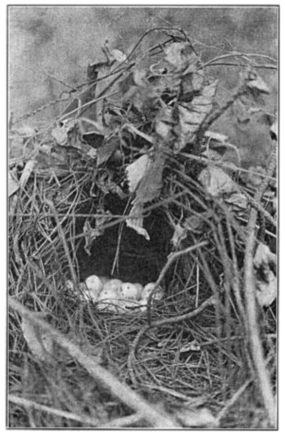
Fig. 23. Nest of California Quail, with 23 eggs, in Golden Gate Park, San Francisco.