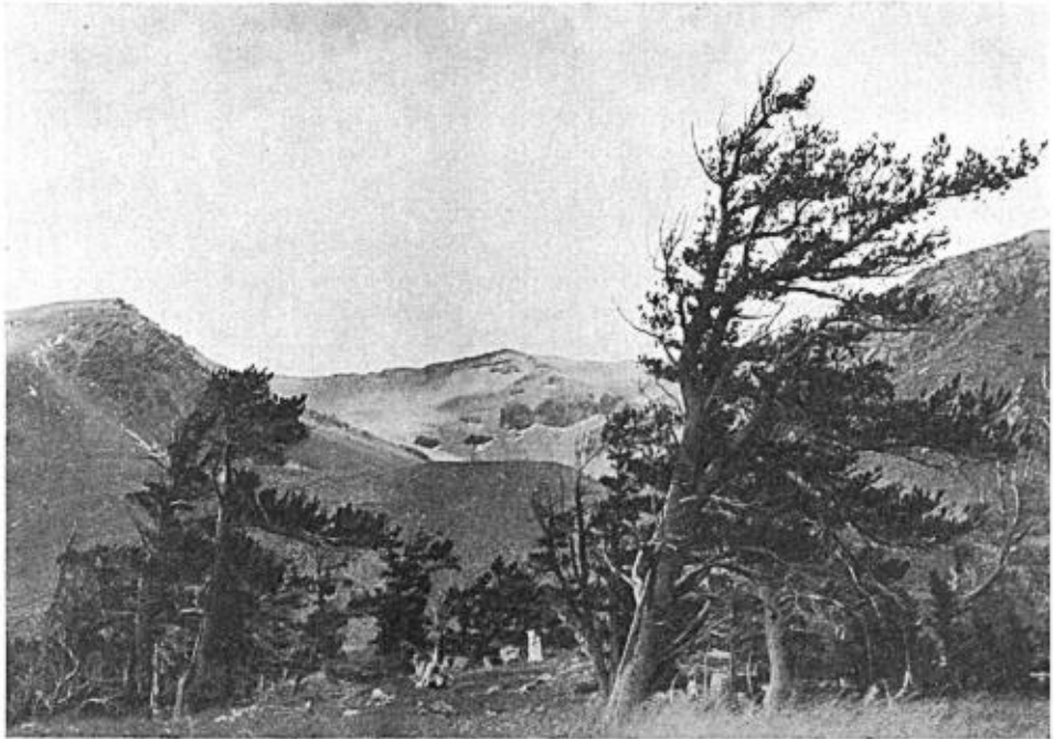
Fig. 37. FOXTAIL PINES IN BUCKSKIN GULCH, THREE MILES ABOVE ALMA, AT ABOUT 11,500 FEET ALTITUDE

Leucosticte australis. Brown-capped Rosy Finch. Seen September 24, 26, and 28, in South Mosquito Gulch, on Buckskin Ridge, and on Mt. Lincoln, always at high elevations, timber-line or higher. At about 12,000 feet in South Mosquito I found a flock of 15 or 20. Several of them worked down a little lower and perched in some dead trees, in the topmost branches, something I do not recall having seen these birds do before, though when at lower elevations in winter I have seen them in low bushes or trees. One specimen secured.