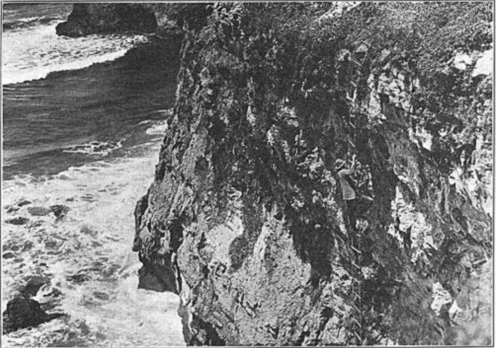
Fig. 6. VROOMAN AT THE SWIFT'S NEST

the bird would emerge, so we ranged ourselves along the crest of the cliff (Mr. V's son Benjamin and my son William accompanying), while our guide proceeded to make diabolical noises with a "contraption" rigged up for the purpose. Nothing happened for a long time, but finally from some invisible portion of the undercut cliff beneath our feet, a dark form flashed downward, and glided, with strong wing-motion, close to the surface and straight out to sea. It was a Black Swift undoubtedly; but what extraordinary behavior for a land bird! With 8-power binoculars I watched it out of sight. Then we drove a steel pin, shook out a rope ladder which did not quite reach the bottom of the 65-foot declivity, and set about the systematic search of the under-cut seawall. An hour later V. announced his success, and I hastened down to view the treasure—a great white egg, evidently fresh, but somewhat discolored by