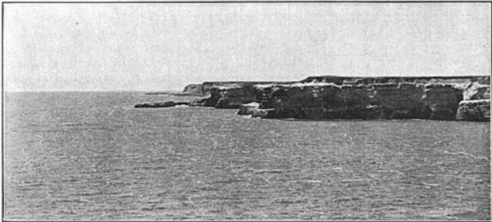
Fig. 5. A BIT OF SANTA CRUZ COAST