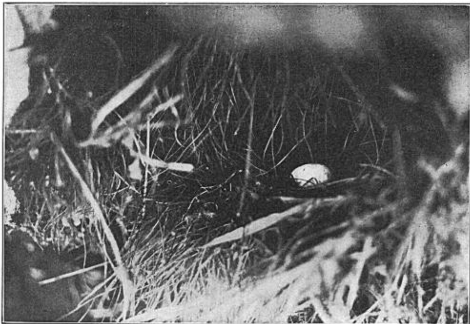
Fig. 7. EGG (NO. 11) OF BLACK SWIFT, in situ

After "snapping" the egg in situ with the Graflex, I packed it away securely and lifted the nesting cornice, earth, grass, rootlets and all, clear of its limestone moorings.