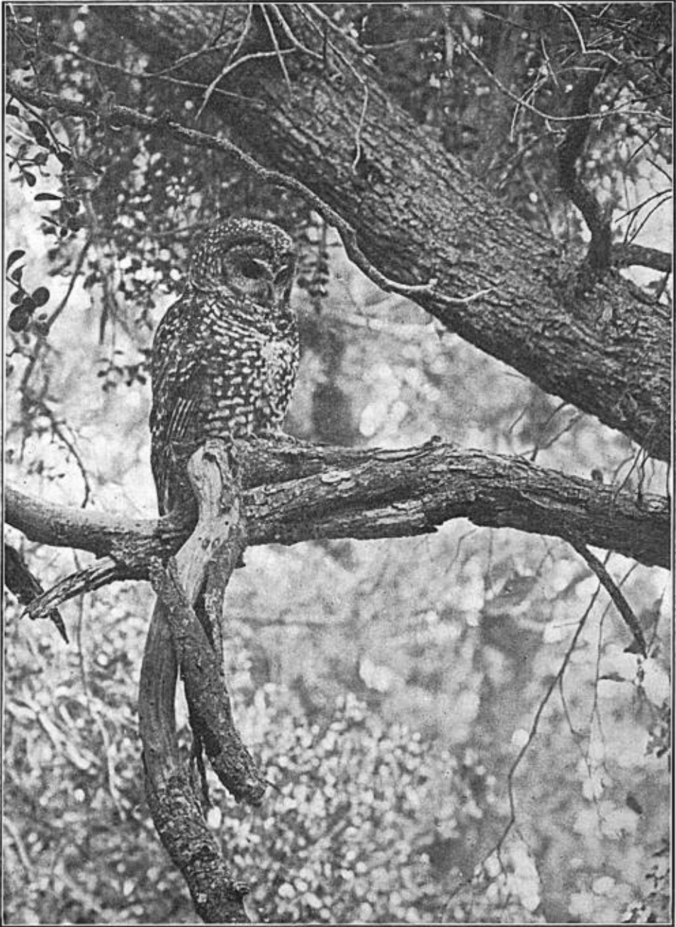
Fig. 55. AN ADULT SPOTTED OWL, Strix occidentalis , PEERED AT US FROM A CLOSE PERCH IN AN OAK.