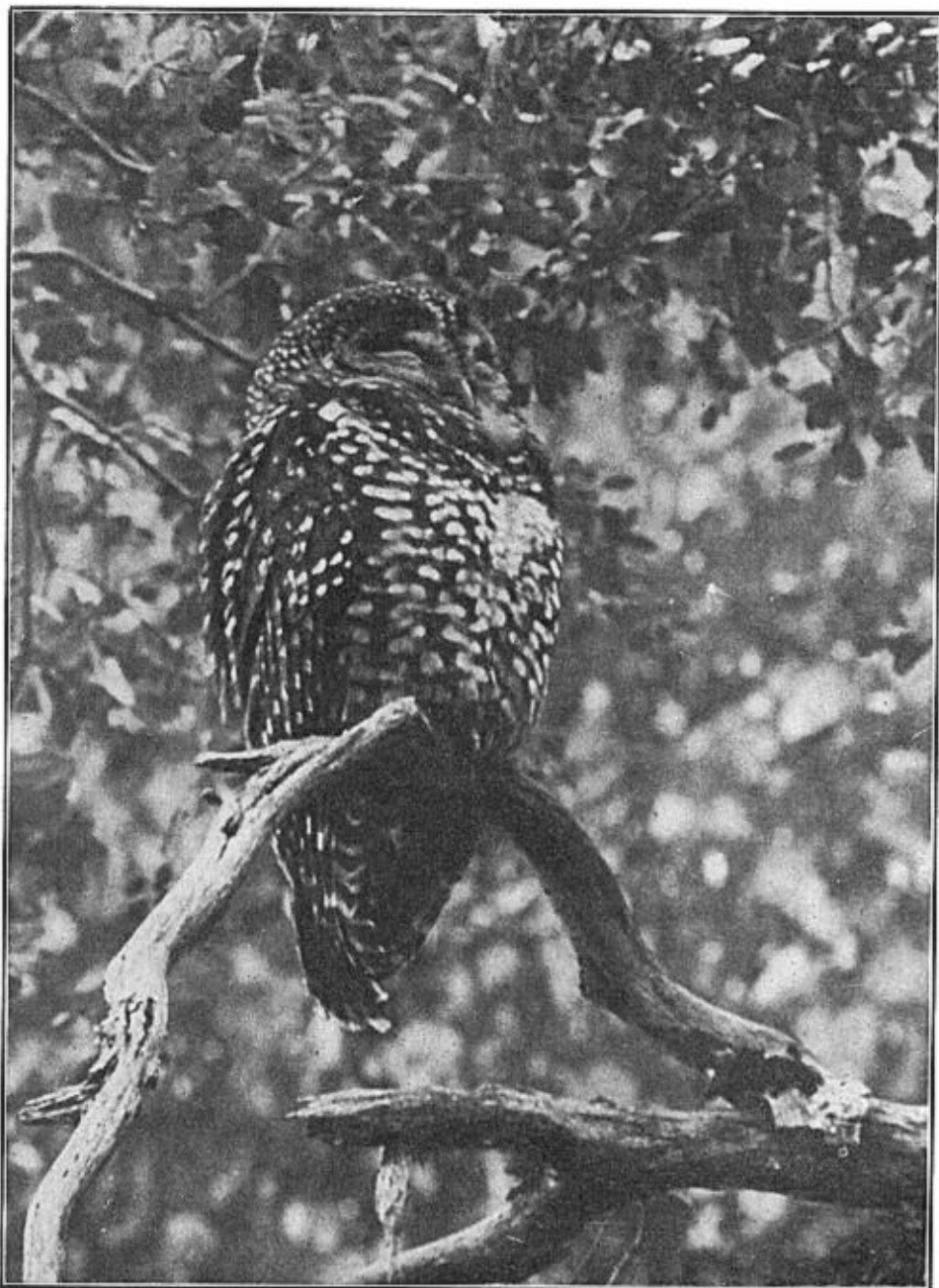
Fig. 57. SPOTTED OWL: AS SHE SAT IN THE SPOTTED LIGHT AND SHADE OF THE OAK FOLIAGE HER HARMONIZATION WAS STARTLINGLY COMPLETE.