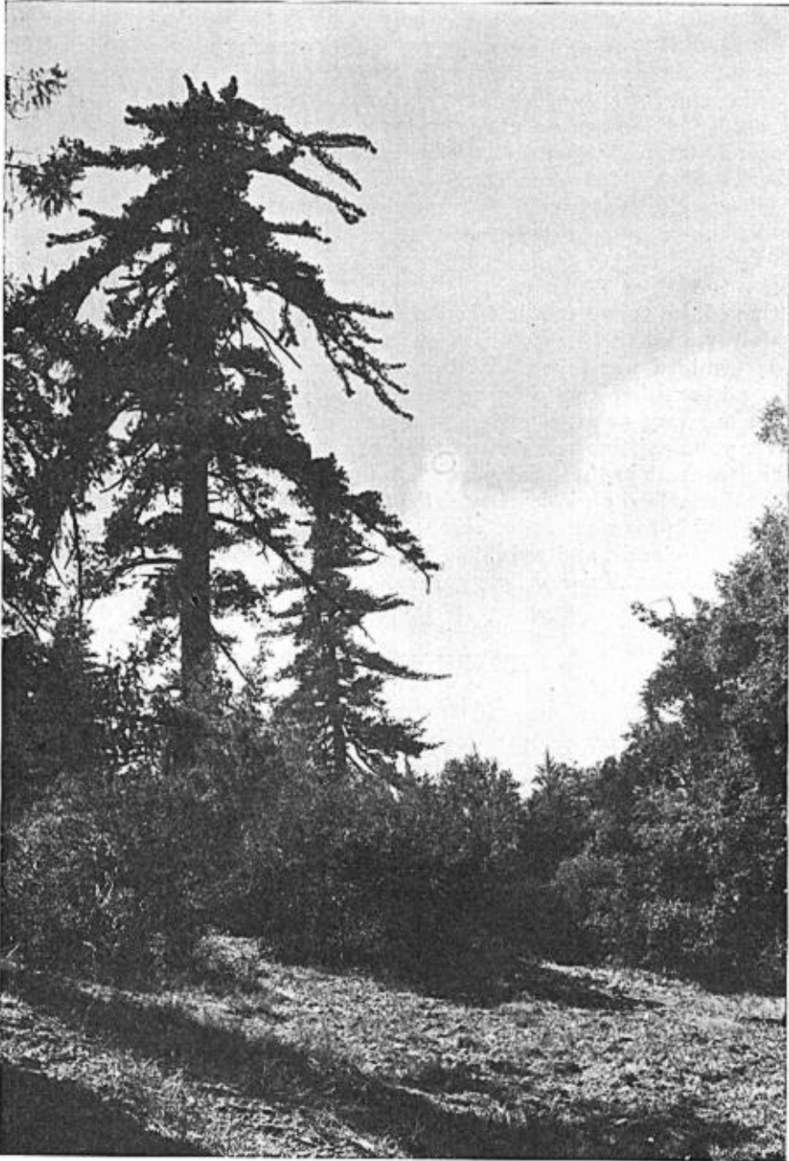
Fig. 61. A WILDERNESS OF PINES AND CLOUDS.

In the nest were the remains of another freshly-killed Neotoma , the dried