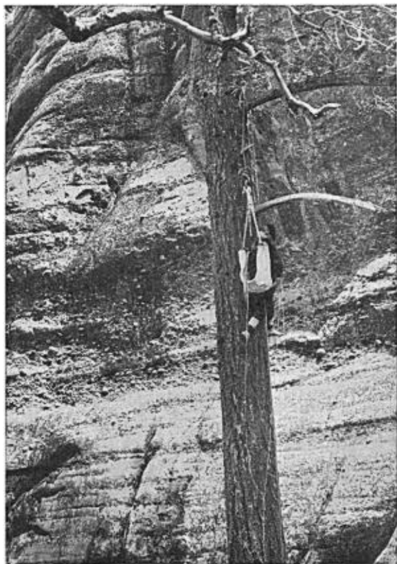
Fig. 56. SWINGING FROM THE FIR FIFTY FEET ABOVE THE GROUND.

But the condors were destined to disappoint our photographic hopes. When we reached the spot again, after a slow-passing two weeks' delay, we found the birds still circling about the cliff, but a stiff climb showed the nesting ledge to be untenanted that year. For some reason they had not gone to