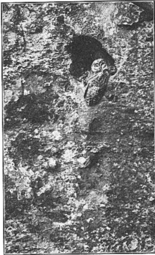
Fig. 58. SPOTTED OWL: THE NEST WAS A POT-HOLE SIXTY-FIVE FEET ABOVE THE GROUND.

The new perch made photography impossible, but as we sat watching her we were treated to a glimpse of her morning toilet.