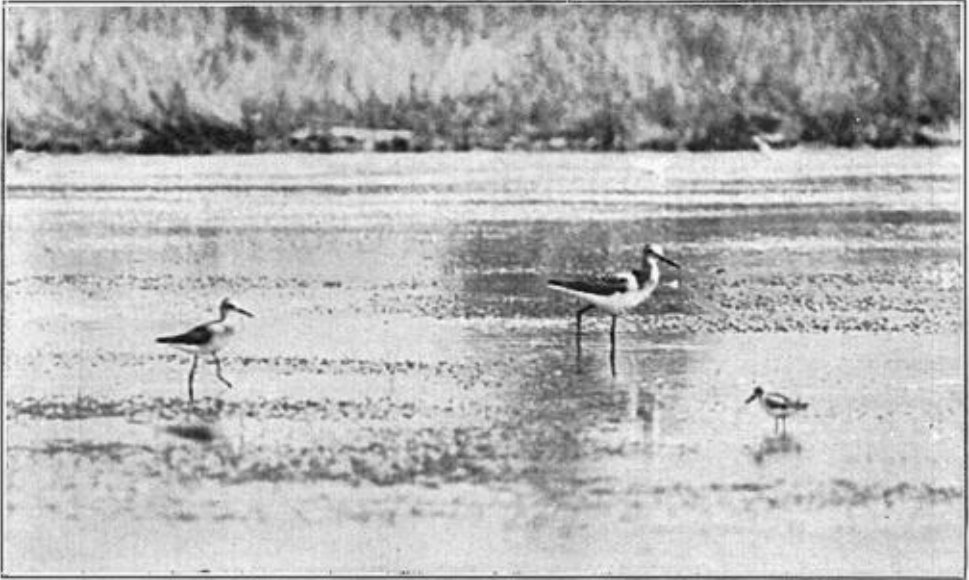
Fig. 58. LESSER YELLOW-LEGS IN COMPANY WITH NORTHERN PHALAROPE (AT LEFT) AND WESTERN SANDPIPER (THE SMALLEST BIRD OF THE THREE); PHOTOGRAPH TAKEN ON THE ESTERO NEAR SANTA BARBARA, CALIFORNIA, AUGUST 16, 1913.

At the time these photographs were taken there were eleven of the Lesser Yellowlegs present on our Estero, and they were to be found in varying numbers for about two weeks thereafter. They proved to be rather timorous on all occasions but especially so when incited to flight by the Killdeers, which were always bossing them about. In moving to and fro across the Estero they usually paid little attention to their own kind and were as ready to join a bevy of Long-billed Dowitchers or Northern Phalaropes or the solitary Greater Yellowlegs