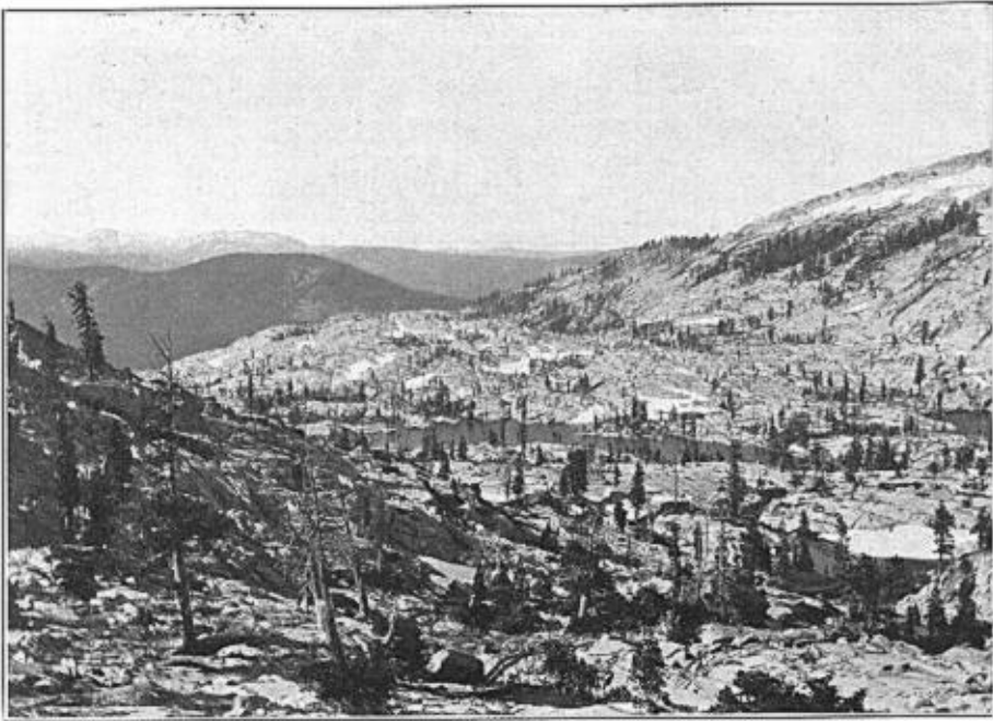
Fig. 54. DESOLATION VALLEY, 8000 TO 8500 FEET ALTITUDE, NEAR PYRAMID PEAK, EL DORADO COUNTY, CALIFORNIA

On June 15, after our return to Bijou on the shore of Lake Tahoe, I found a deserted submerged nest of the Wilson Phalarope ( Steganopus tricolor ) at Rowland's Marsh, with four eggs. The shells of these on examination proved to be very flexible; whether the condition was due to some peculiarity of the eggs