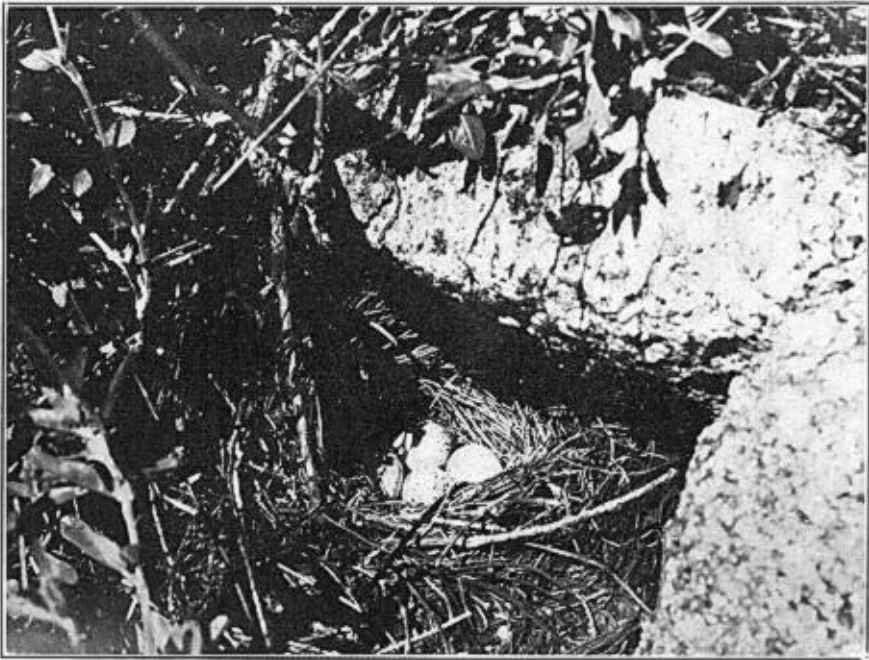
Fig. 55. NEST OF SIERRA JUNCO, ON SLOPE OF PYRAMID PEAK ABOVE FORNI'S, ELDORADO COUNTY, CALIFORNIA

On June 26, after we had again returned to Bijou, I secured on the west side of Lake Valley a very dark plumaged Western Red-tailed Hawk. The skin was sent to Mr. Joseph Grinnell at Berkeley, who writes as follows concerning it: "The bird is an immature female of Buteo borealis calurus , and is catalogued as no. 13991 of the collection of the California Museum of Vertebrate Zoology. In its dark phase of plumage it resembles examples from elsewhere in California in similar stage. It does not seem possible to correlate this depth of coloration in certain individuals with altitude or with any other circumstance I can think of."