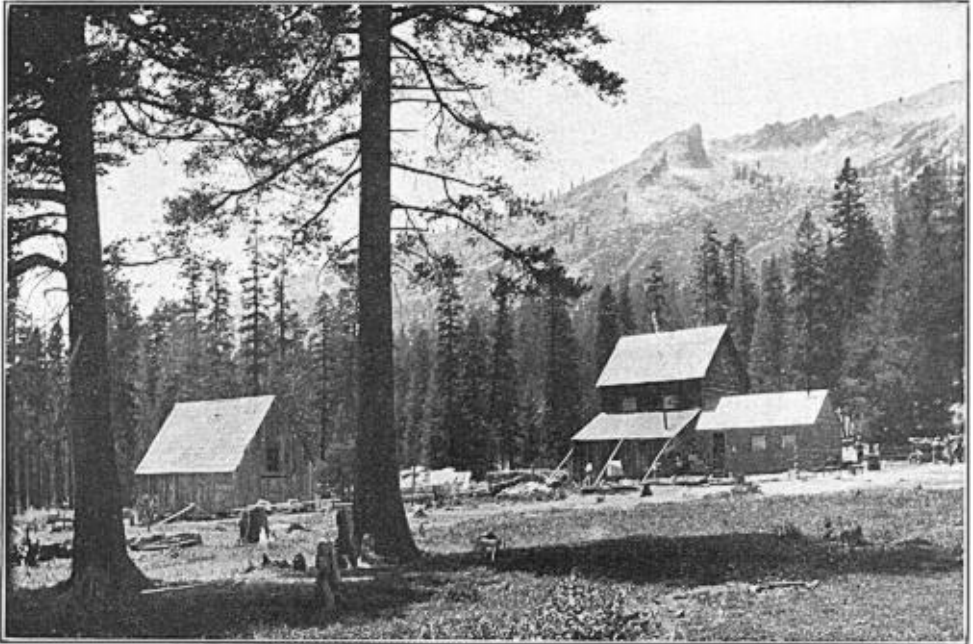
Fig. 53. PHILLIPS' STATION, 7000 FEET ALTITUDE, SIERRA NEVADA, IN ELDORADO COUNTY, CALIFORNIA

Near Seven Pines, on June 11, a loud, mingled chorus of bird cries drew us into a thick forest of pines and firs. Here we came upon a Western Red-tailed Hawk hovering just above a nest full of young Western Robins. The parent birds