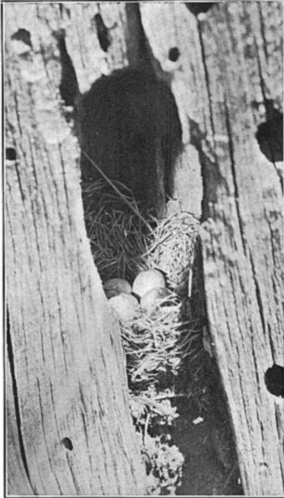
Fig. 6. AN UNUSUAL NESTING SITE OF THE SIERRA JUNCO AT LAKE-OF-THE-WOODS

trail Heinemann flushed a Sierra Junco ( Junco hyemalis thurberi ) from its nest, well concealed among weeds and containing two small young and an infertile egg. It was nearly dark when we reached the lake, which we found almost entirely frozen over, while most of the surrounding country was covered with snow. During the chilly night the ice-covered lake and its snowy shores, glittering in the moonlight, presented a landscape that seemed more like one in the dead of winter than on the first of July. In strange contrast to the cold nights, in these altitudes