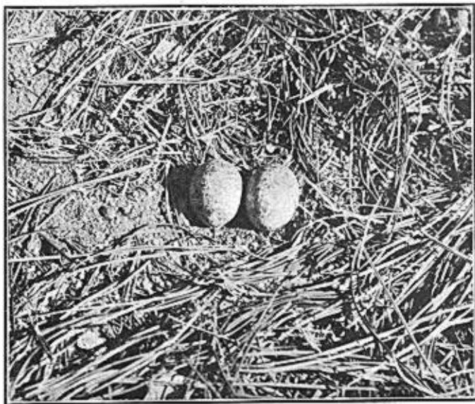
Fig. 7. EGGS OF THE PACIFIC NIGHTHAWK in situ