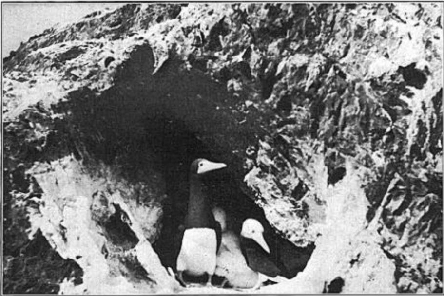
Fig. 36. A FAMILY OF BREWSTER BOOBIES, BOTH PARENT BIRDS, AND ONE YOUNG ONE IN THE NATAL DOWN. THE NEST IS IN A CREVICE NEAR THE TOP OF A CLIFF

"In the waters close to the breeding ground large flocks were seen. When I first arrived, March 24, there were an immense number of birds. The males were constantly seen fluttering over the females on the ground, near their nests; but no eggs were laid until April 2. It seems they spend some time in courtship before settling down to their matrimonial duties. The female when in passion emits a peculiar squeaky sound as she coaxes the male by squatting down and going through the most ludicrous motions. I have also seen a pair holding on to each other's bills, a kind of tug-of-war affair; then they would back away and go through a suggestion of a dance, but all the time talking to each other in low love tones.