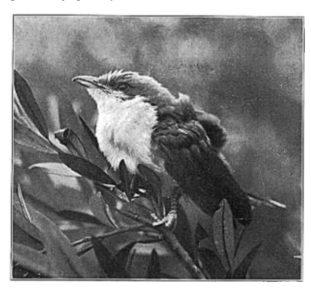
Fig. 32. YOUNG OF CALIFORNIA CUCKOO, AUGUST 14,1910

The note in the breeding season is a quickly uttered "kuk-kuk-kuk", and is generally given at some little distance from the nest. The birds when in close proximity to the nest are usually silent. If the eggs are taken or destroyed, a second and even a third set will be laid within a very few days. The young when first hatched are naked and look as though they were made of India rubber. They grow very quickly, and I believe if undisturbed two broods are reared in a season.