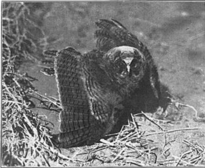
Fig. 13. YOUNG LONG-EARED OWL, PHOTOGRAPHED NEAR HOOPER, COLORADO

Asio wilsonianus. Long-eared Owl. At our camp at a deserted ranch, just outside the town of Hooper, Durand found the dead bodies of one adult, apparently a female, and three young Long-eared Owls, and one living young bird, the latter perched in a tree; it was able to fly. I secured several photographs of it, all taken