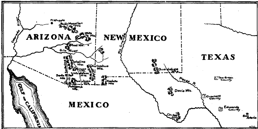
MAP SHOWING UNITED STATES RANGE OF THE MEARNS QUAIL

The Mearns Quail is found along a considerable extent of the Mexican Boundary of the United States, being, however, very local and extremely irregular in its distribution. It is a bird of the Upper Sonoran and Lower Transition zones, fond of rough, brushy hillsides, and but seldom venturing out into the open valleys. In Arizona it has been recorded from almost all the higher mountains of the southeastern portion of the Territory, but these are nearly all more or less completely isolated ranges, and there are large tracts of country intervening, not at all suited to the species, where other species of quail occur, Lophortyx gambeli and Callipepla squamata . The species was found in the Mogollon Mountains by Dr. Mearns, reaching its northern and western limit near Fort Whipple, where Dr. Coues secured two specimens in 1865. Henshaw speaks of it as a common resident in the White Mountains, where he secured adults and young in August and September. Scott found it on the San Pedro slope of the Catalina Mountains, ranging from 4000 to 5700 feet, and at the head of Mineral Creek in the Pinal Mountains. It has also been found in the Chiricahua, Santa Rita, Patagonia, Huachuca, and Rincon Mountains. Thus its distribution in Arizona may be traced with a fair degree of accuracy.