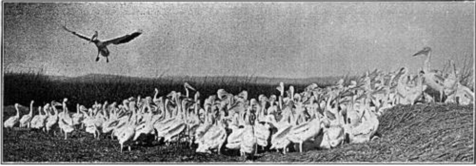
AN ADULT PELICAN JUST DROPPING INTO ROOKERY

birds as they soared about. Then it was thrilling to see some of them descend with rigid, half-closed wings. They used the sky as a big toboggan-slide and dropped like meteors, leaving a trail of thunder. Several times when we first heard the sound, we were deceived into thinking it was the advance messenger of a heavy storm and jumped up expecting to see black clouds rising from behind the mountains.