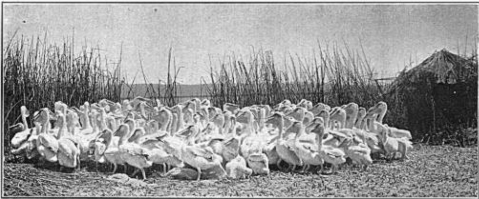
HERD OF YOUNG PELICANS; NOTE THE TULE-THATCHED BLIND AT RIGHT, FROM WHICH THE CAMERA WAS OPERATED IN OBTAINING MORE INTIMATE LIFE-STUDIES

When we crossed over to Lower Klamath Lake, we found it very different from the south end of Tule Lake, where we had fairly good places to camp. Extending for several miles out from the main shore was a seemingly endless area of