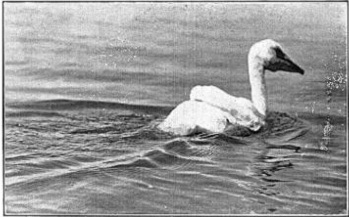
IN THE SWIM AT AN EARLY AGE

pitched awkwardly in and alighted near by and several young birds waddled forward to meet her. She caught sight of a piece of partly dried fish that had been disgorged, grasped it in her bill and tossed it away before one of the youngsters could grab it. One of the other birds rushed for it, but she was ahead and threw it as far as she could again, and the third time she