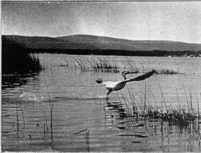
A HEAVY BIRD LIKE A PELICAN RISES FROM THE WATER WITH DIFFICULTY, AND USES ITS FEET IN GETTING A START