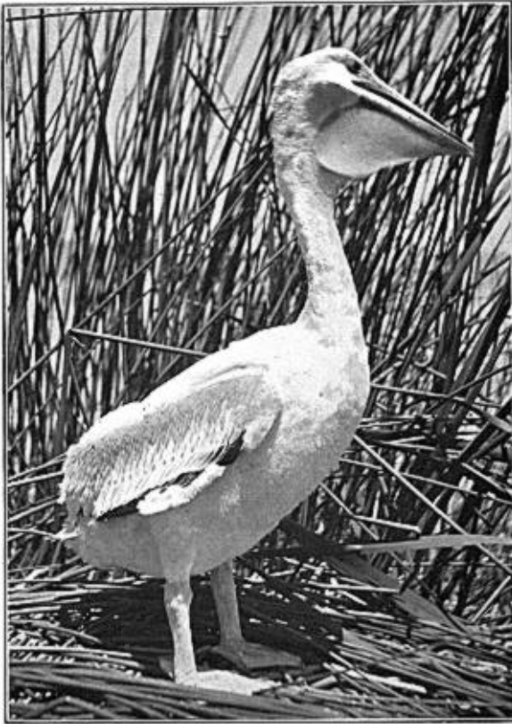
HALF-GROWN YOUNG PELICAN WITH WING QUILLS PARTLY GROWN, BUT BODY YET COVERED WITH DOWN

It takes about a month for the pelican to hatch its eggs, and the baby pelican is naked, helpless and ugly, and has to be shielded from the sun by its mother. Its ugliness increases with age till the youngster is covered with white down. The young birds stick close to the nesting site where they are fed by the parents, until, when about six weeks old, they begin to run about and mingle with the other young birds.