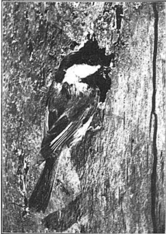
CHICKADEE AT NEST HOLE

Once the mother came with a white miller. She had pulled the wings off, but even then it looked entirely too big for a baby's mouth. Not a single nestling but wanted to try it. When the mother left, I looked in and one little fellow sat with the miller bulging out of his mouth. It wouldn't go down any further, but he lay back in apparent satisfaction; digestion was working at a high speed below. I saw the miller gradually slipping down, until finally the last leg disappeared as he gave a strenuous gulp.