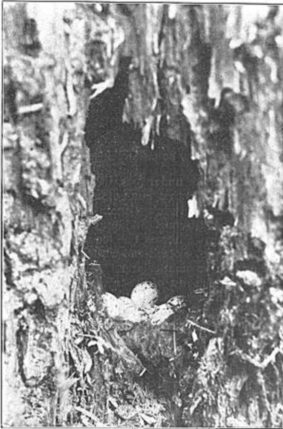
NEST AND EGGS OF CHICKADEE; STUMP OPENED FROM REAR; ALL SEVEN EGGS HATCHED

I'll never forget the day we trudged up with the camera to get a picture of the eggs. When we reached the chickadee villa, the mother was at home. I