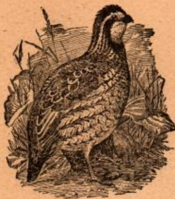
Reproduced line-cut of Ernest Thompson Seton's painting of the Bob-White presented to every subscriber to Vol. VIII, 1906, of Bird-Lore. The Original is nearly life-size.

Tell us to whom you wish to send BIRD-LORE (a bi-monthly magazine for bird-lovers, edited by Frank M. Chapman) for you during 1906, and we will forward a Christmas card giving your name as donor, a beautiful, nearly life size drawing of the Bob-White, by Ernest Thompson Seton, and a free copy of our December, 1905, issue containing 13 birds in color from drawings by Fuertes and Horsfall and over 100 pages of text.