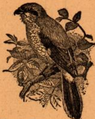
Reduced line cut of ERNEST THOMPSON SETON's painting of the Northern Shrike. Presented to every subscriber to Vol. VII, 1905, of BIRD-LORE. The original is nearly life-size.

Bird-Lore's Motto:—A bird in the bush is worth two in the hand