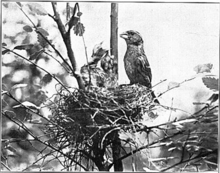
FEMALE GROSBK AT NEST

The parents fed their bantlings as much on berries as on worms and insects. Once I saw the father distribute a whole mouthful of green measuring worms. The next time he had visited a garden down the hillside, for he brought one raspberry in his bill and coughed up three more. Both birds soon got over their mad anxiety every time we looked at the youngsters. In fact, they soon seemed willing enough