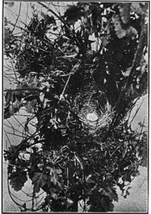
NEST OF LUTESCENT WARBLER