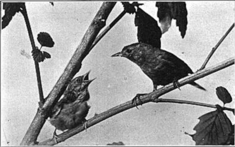
LUTESCENT WARBLER AND YOUNG

This warbler is not showy like some of its cousins, but in harmony with