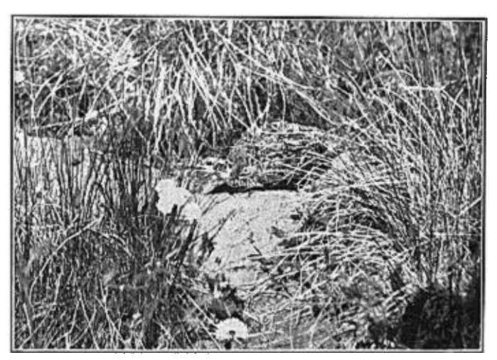
YOUNG BLUE GROUSE, PECOS MTS., N. M.

While she was hunting up her second fledgling, the first one, the one that I