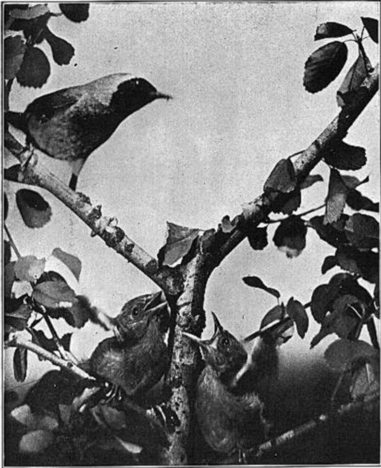
MALE YELLOW-THROAT AND YOUNG

gotten quite used to the camera. I had the instrument leveled point blank at the nest only a yard distant. A gray figure came flitting over the tree top and planted himself on the limb right beside the home. He carried a green cut-worm in his mouth. No sooner had he squatted on his accustomed perch than he caught sight of the cyclops. With an astonished chirp, he dropped his worm, threw a back somerset, and all I saw was a meteor-like streak of gray curving up over the pointed firs. I doubt if he felt any degree of safety till he got across the Willamette,