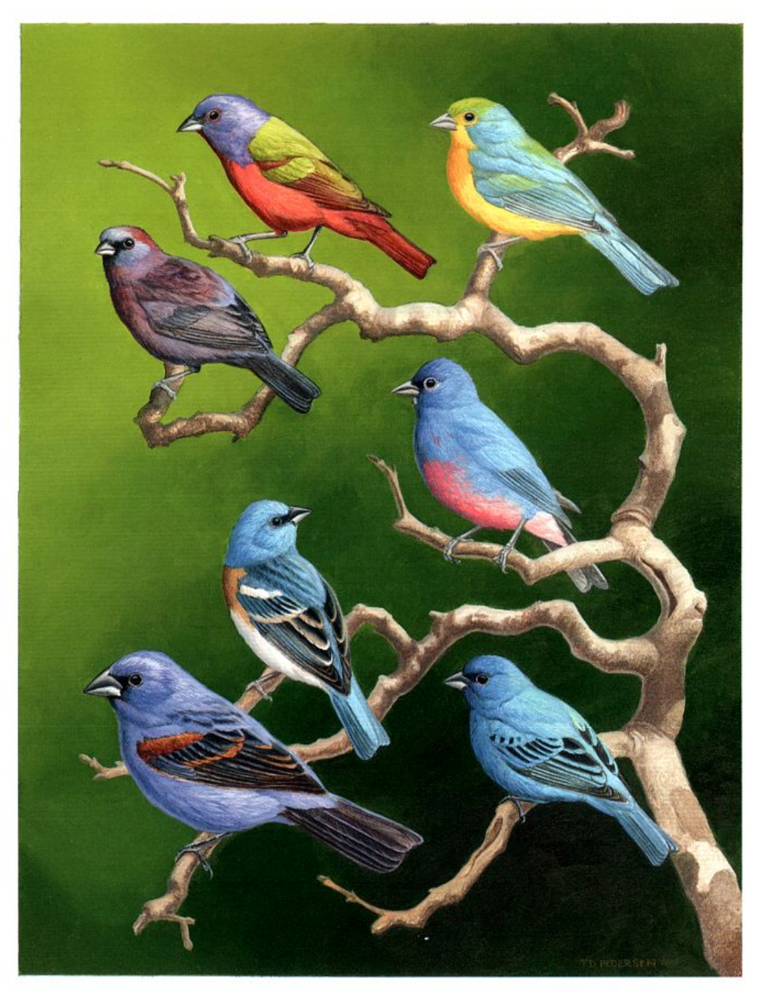
COLOR PLATE. The genus Passerina. The branching pattern reflects hypothesized relationships based on results of this study.