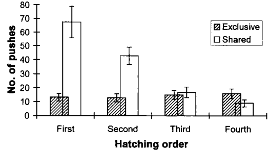
FIG. 1. Number of pushes per Arabian Babbler nestling ( \bar{x} \pm \text{SD} ) in exclusive and shared feeding spaces in relation to hatching order.

Exclusive vs. shared feeding spaces: Food distribution and size. —During the sampling period, each nestling obtained an average of 51.4 \pm 7.9 feedings ( n = 76 ) within its exclusive feeding space and 36.8 \pm 23.6 feedings within its shared feeding space. The average size of exclusive feeding spaces was 7.9 \pm 0.9 cm 2 , and