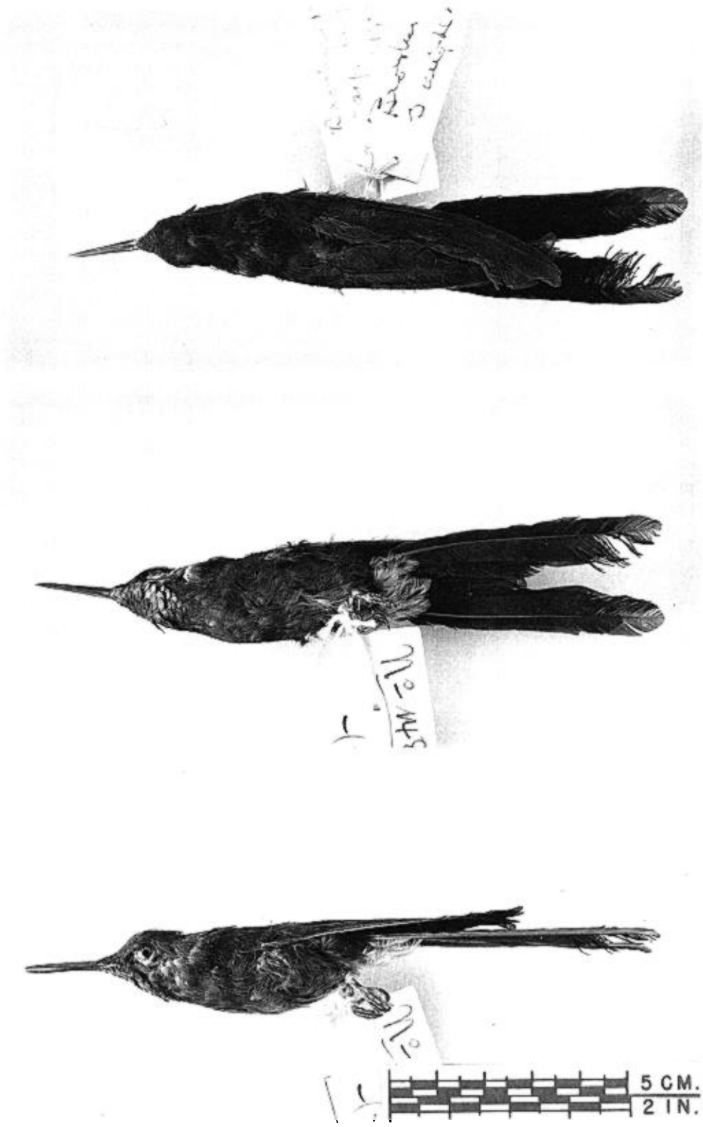
Fig. 1. Dorsal, ventral, and lateral view of holotype of Heliangelus zusii .