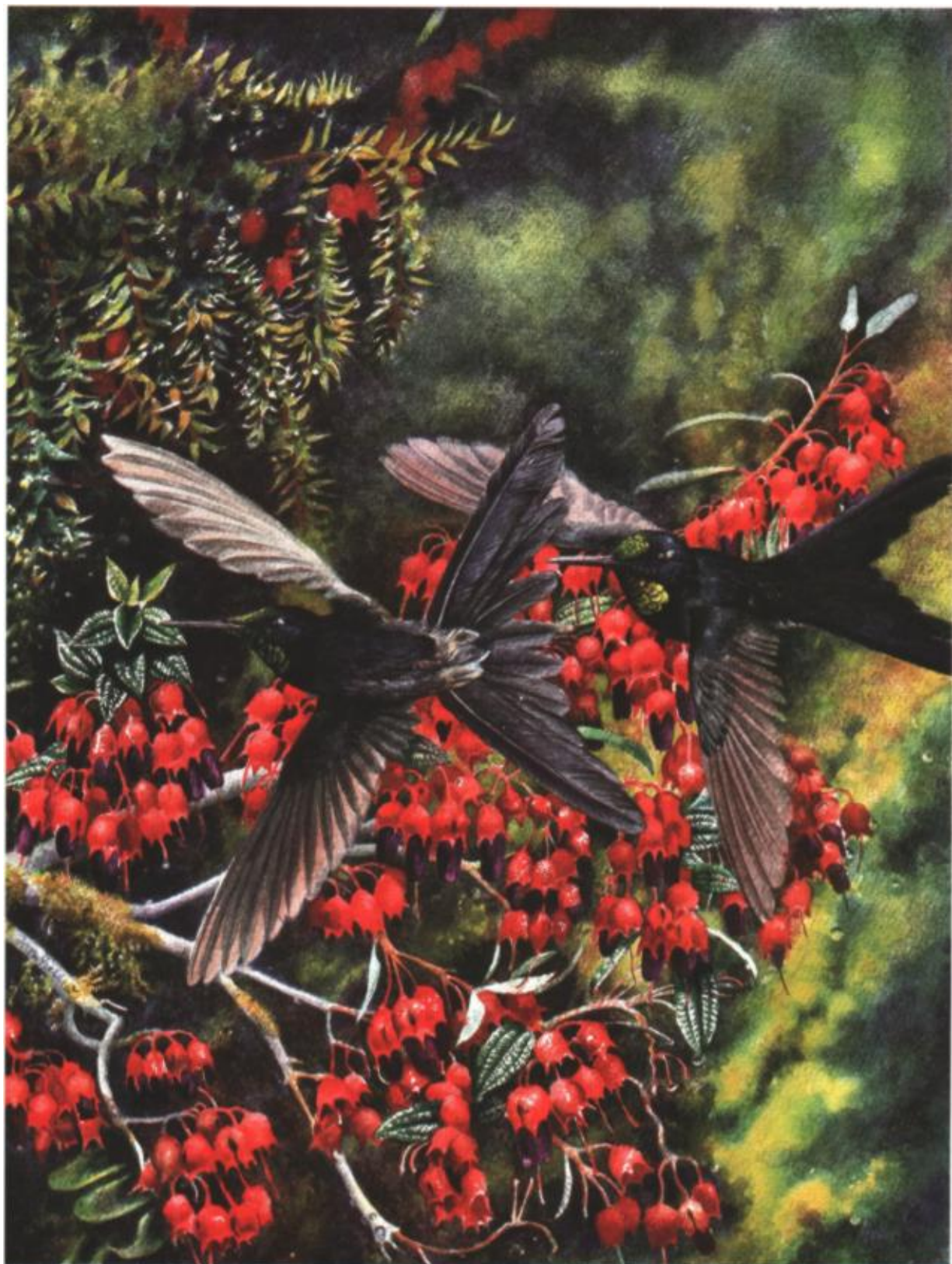
Frontispiece. Aerial pursuit of male Bogotá Sunangels ( Heliangelus zusii sp. nov.) above flowering Brachyotum microdon , a common melastome in the Eastern Cordillera of the Colombian Andes. Painting by Jon Fjeldså.