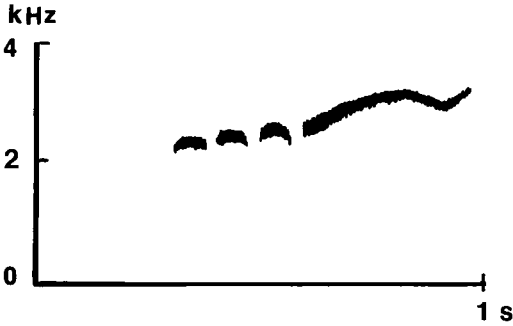
Fig. 3. Songlike vocalization of Dysithamnus occidentalis punctitectus given after playback of scold and calls in Figure 1. This vocalization delivered consistently (six times) but quietly (in the manner of a sub-song) by a male.

2A) is very similar to calls of several species of Dysithamnus . As a type, this call is characteristic of Dysithamnus (although it may not be given by all species) and may function as a contact note between members of a pair or family group (pers. observ.). I am unaware of any members of Thamnophilus or Thamnomanes that regularly give this call. A comparison of the "peeur" calls of the sympatric T. occidentalis (Fig. 2A), D. p. leucostictus (Fig. 2B), and D. mentalis napensis (Fig. 2C) reveals the close similarity in this call among these three species.