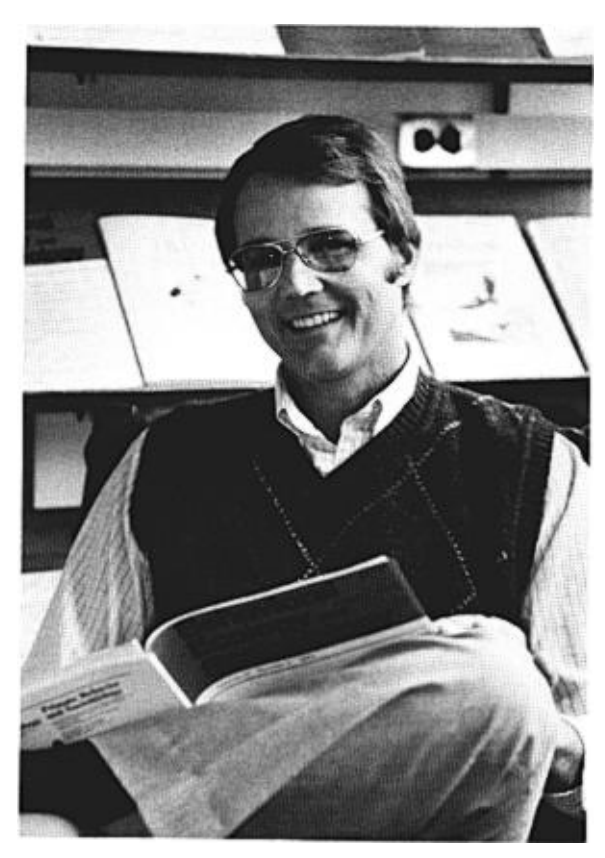
WILLIAMS BREWSTER MEMORIAL AWARD, 1984