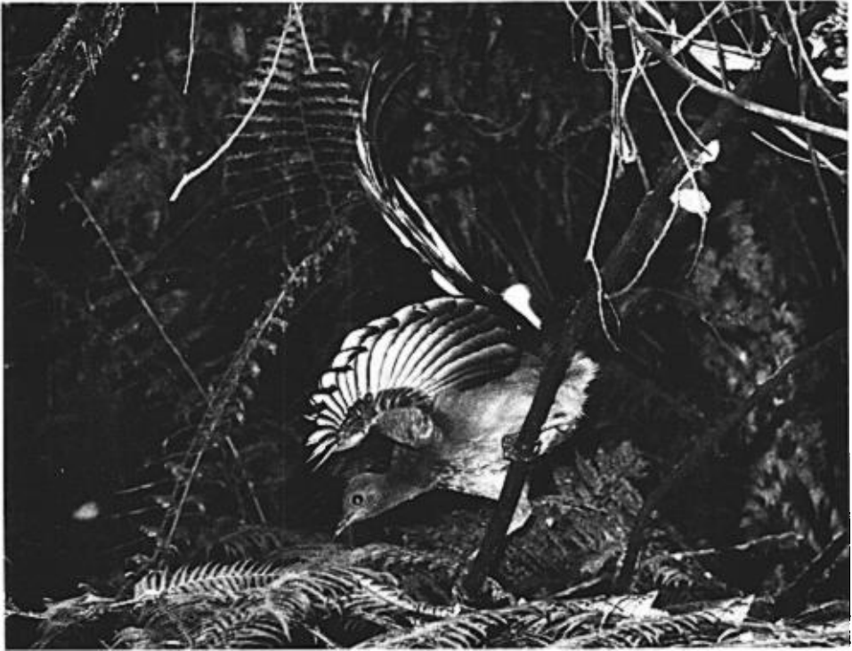
Fig. 1. A nesting female threatens the author during a brief nest inspection at the nestling stage.

by, identified birds on sketch maps. Sexual interactions of identified birds were recorded opportunistically in this area over the same period. The plot contained four male and at least seven female territories.