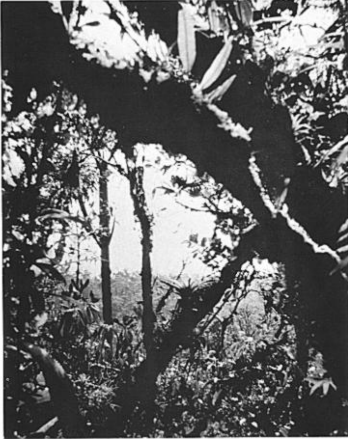
Fig. 3. Photograph of cloud forest at actual site where the type specimen of Xenoglaux loweryi was captured.

dense thickets in canopy openings and along small streams. The forest floor is matted with roots and covered by a thick, peaty humus layer. A great number of tall, slender, emergent palms ( Mauritius ?) and an occasional tree fern give the forest a distinctive and characteristic appearance unlike that of any other subtropical forest in Peru with which we are familiar. Access to this area was very difficult because of the varying terrain and the contorted, impenetrable character of the forest.