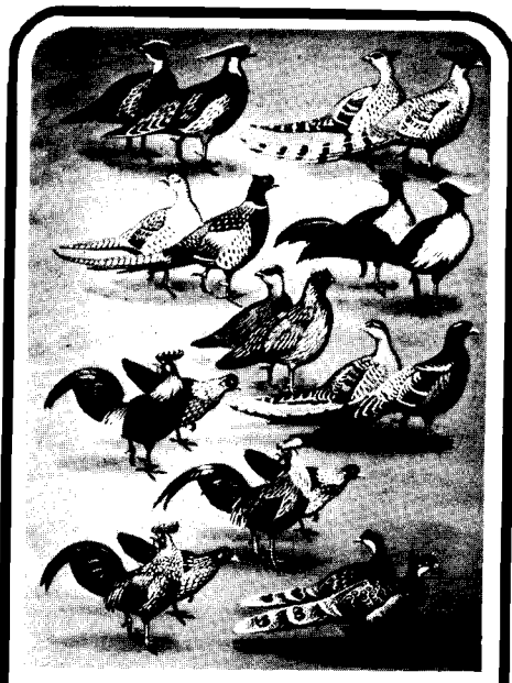
Plate by John Henry Dick from "A Field Guide to the Birds of India." (Actual plate is in full color.)

Several agencies will be offering birding tours to India in 1976. How will they compare?