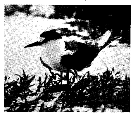
WASHINGTON — May 18 to 27, 1974. This tour is led by Terry Wahl, co-author of "A Guide to Finding Birds in Washington" and organizer of many pelagic trips. Will visit many habitat areas, including a pelagic trip and show you a large number of the state's birds.

If you compare, you'll see that in most cases the cost of our tours is lower, and in every case, the number of birds you'll see is larger. If you like to travel and look for birds, why not get the most value for your dollar?