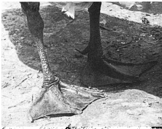
Figure 2. Feet of a gander showing "pachydermal" aspect and other maxima characteristics mentioned in the text.

west shore of Lake Ellsmere, was similar to habitats geese nest in along the Snake River in Washington (Yocom, Pacific Discovery , 20: 26, 1967). I did not see the geese that nest in the Nigger River region of the Esk River; this population may be a different subspecies.