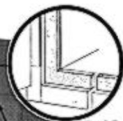
Pest-Proof and Air Tight Seal