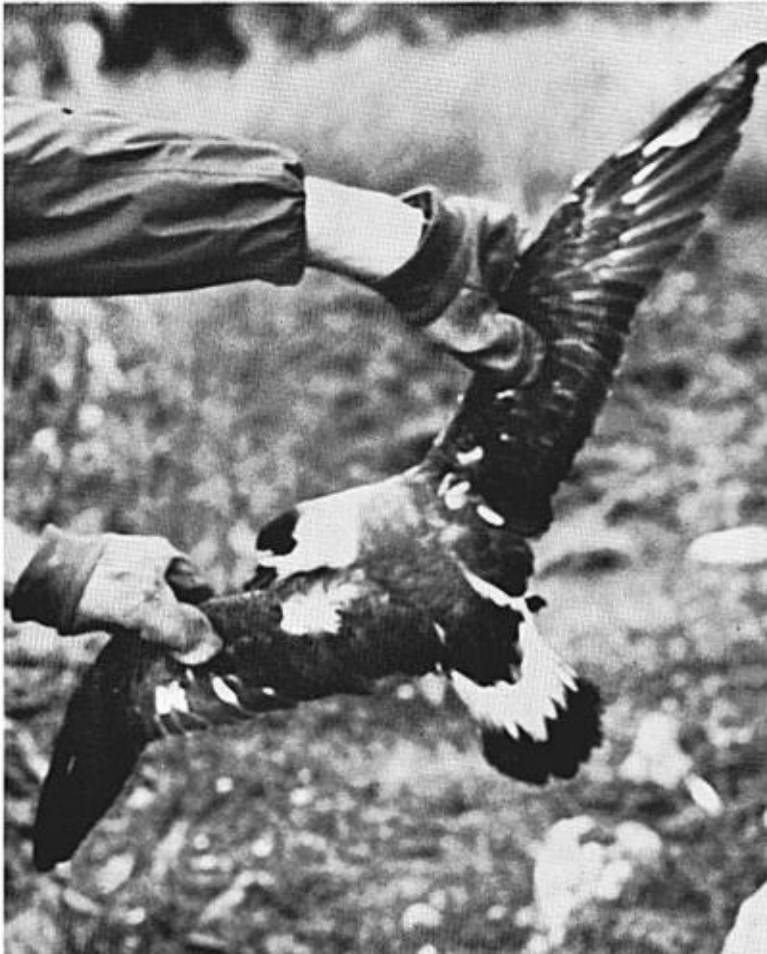
Figure 2. A (above). Living Pterodroma hasitata , dorsal aspect. B (opposite, top). Ventral aspect of the same bird. C (opposite, bottom). View to the east from Morne Cabaio. Tête Opaque in middle distance. The cliff shown is about 600 meters in height. Five petrel colonies occur in the section of cliff shown.

Estimating the number of colonies on Hispaniola was somewhat easier. This was done by calculating the ratio of occupied to unoccupied potential