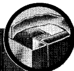
Insect-proof foam plastic seals