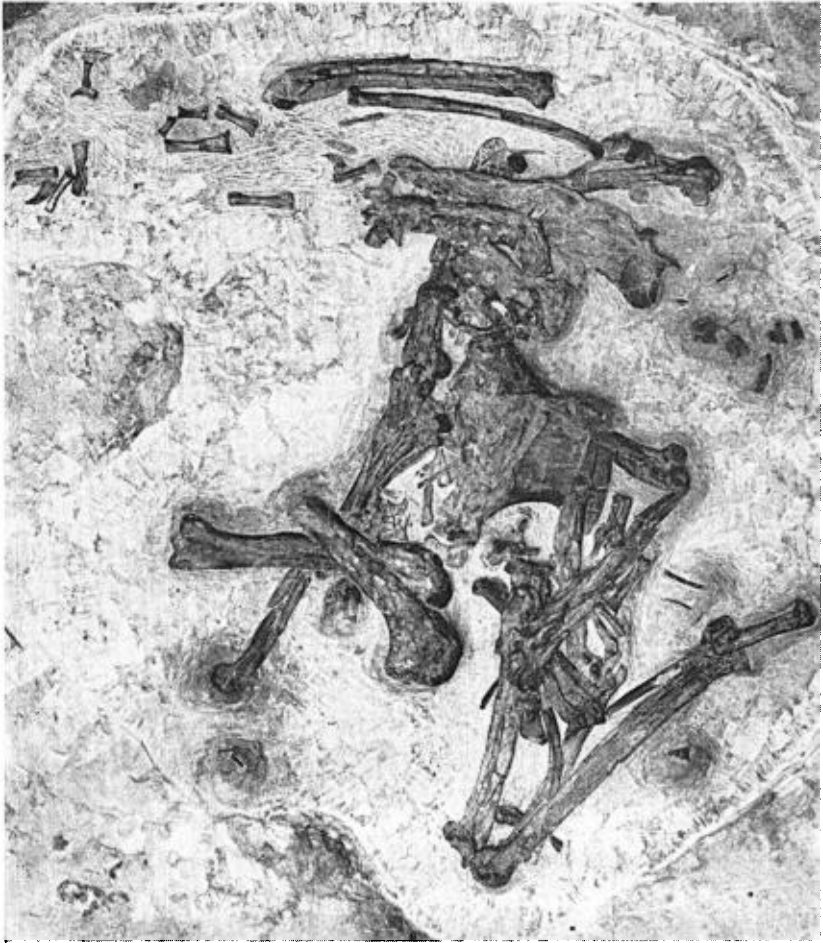
Procra x brevipes. Photograph of type, SDSM No. 511, \times \frac{1}{2} .