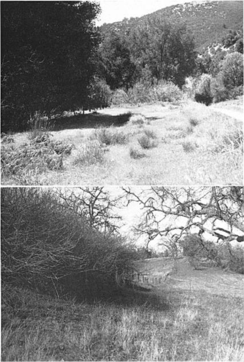
FORAGING AREAS OF THE BROWN TOWHEE. ( Above ) Ground cover mainly of short, interrupted grass and low annuals; adjacent Coast Live Oaks and Coffeeberry provide nearby cover. ( Below ) An extensive thicket of Poison Oak bordered by bare soil, beyond which lies an extensive area of interrupted grassland. Brown Towhees foraged under the thicket, on the bare soil, and in the grassland. The nearby Valley Oak ( Quercus lobata ) supplied much leaf litter to the thicket. Photographs taken April 22 and March 16, 1956, at the Hastings Reservation.