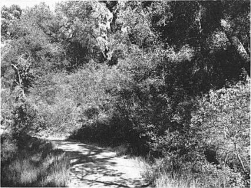
FORAGING AREAS OF THE SPOTTED TOWHEE. (Above) Nearly unbroken leaf litter beneath large Coast Live Oaks ( Quercus agrifolia ). (Below) Mixed brush, mainly Poison Oak ( Rhus diversiloba ), Coffeeberry ( Rhamnus californica ), and Snowberry ( Symphoricarpos rivularis ). The Coast Live Oaks upslope supply much leaf litter to the brushy areas below them. Photographs taken May 13 1956, at the Hastings Reservation.