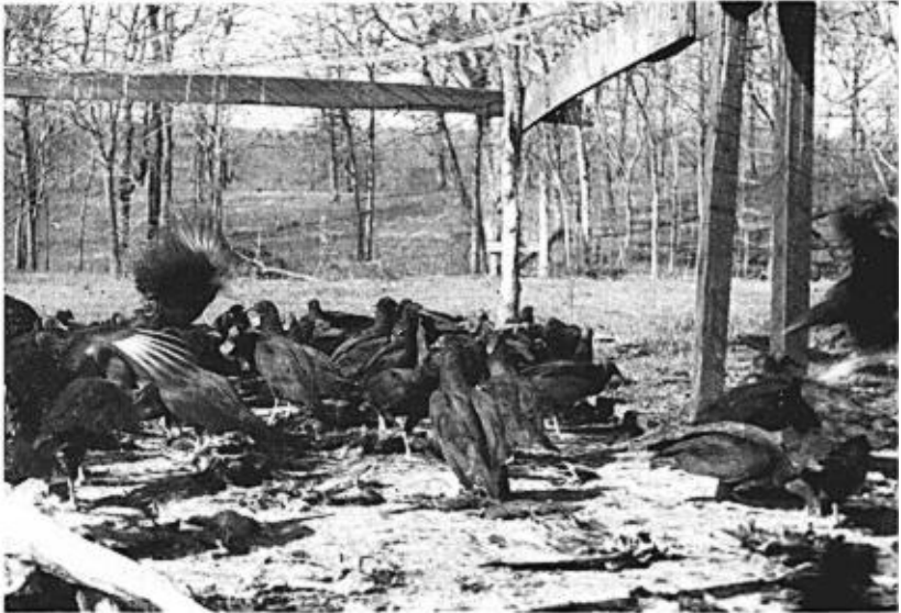
VULTURE TRAP OPERATED BY MR. ALLEN BURGESS, NACOGDOCHES COUNTY TEXAS. ( Top ) Front view showing the V-shaped entrance. ( Bottom ) A portion of over 200 Black Vultures captured the first week in February, 1953.