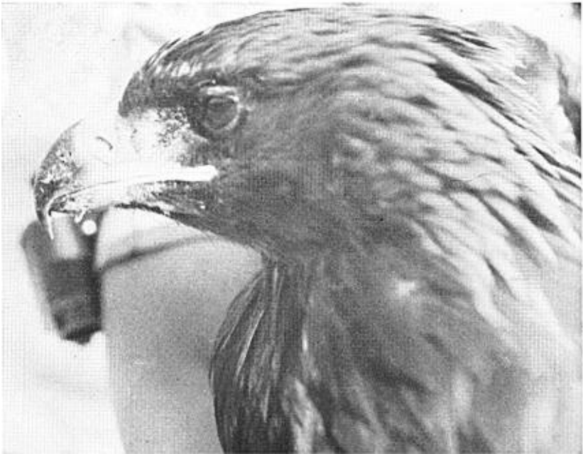
YOUNG GOLDEN EAGLES SHOWING LORES INFESTED BY TICKS.