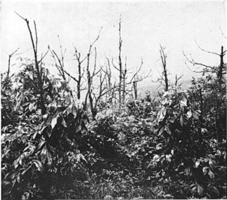
OGLETHORPE MOUNTAIN, GEORGIA. SLOPE NEAR THE SUMMIT SHOWING DENSE THICKETS WHICH HAVE REPLACED THE CHESTNUTS KILLED BY THE BLIGHT (IN BACKGROUND). IN THE FOREGROUND NOTE THE CHESTNUT SPROUTS PERIODICALLY KILLED BACK TO PRODUCE A SHRUB LIFE-FORM.