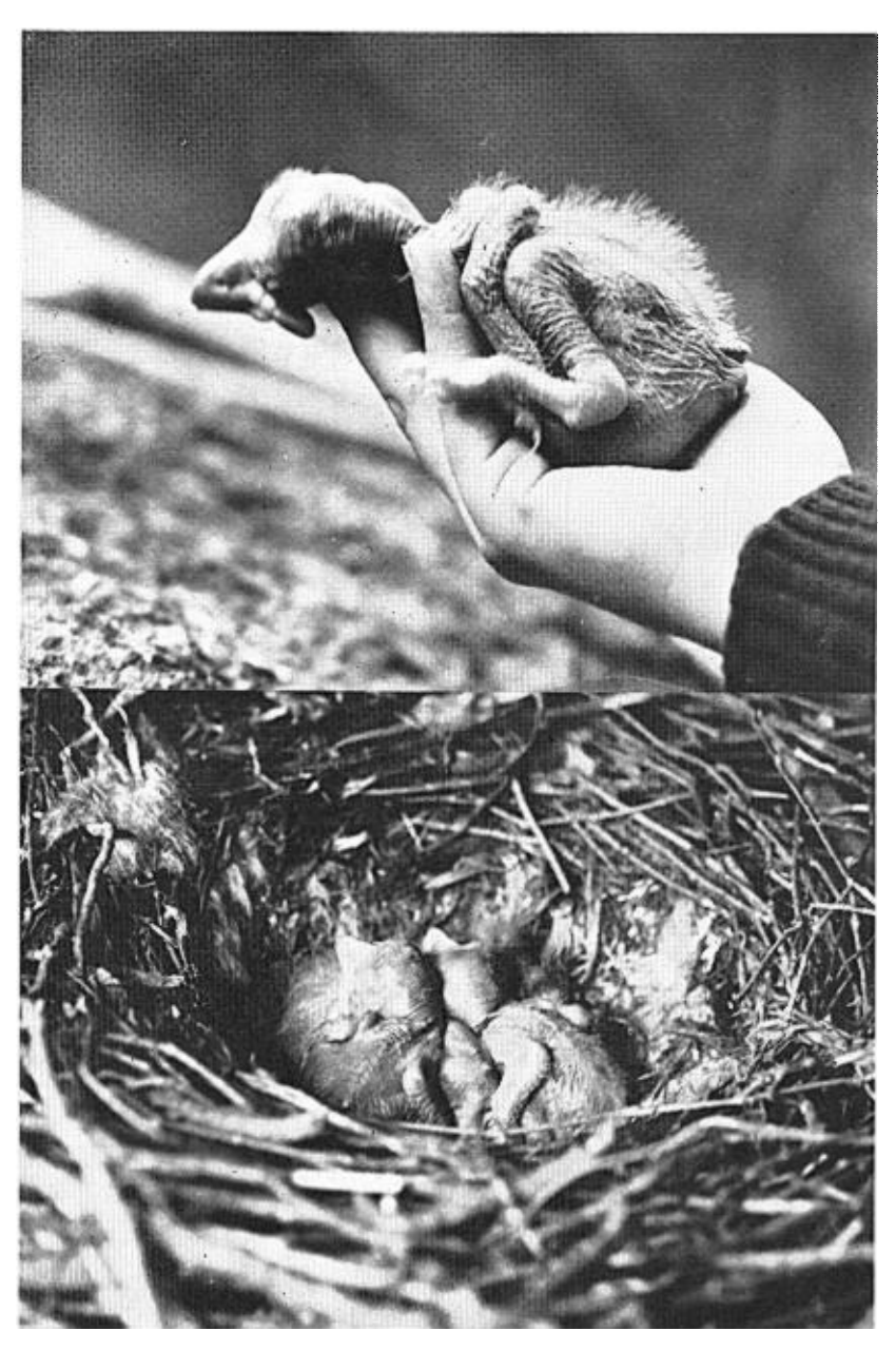
NORTHERN RAVEN.-YOUNG BIRDS LESS THAN ONE WEEK OLD.