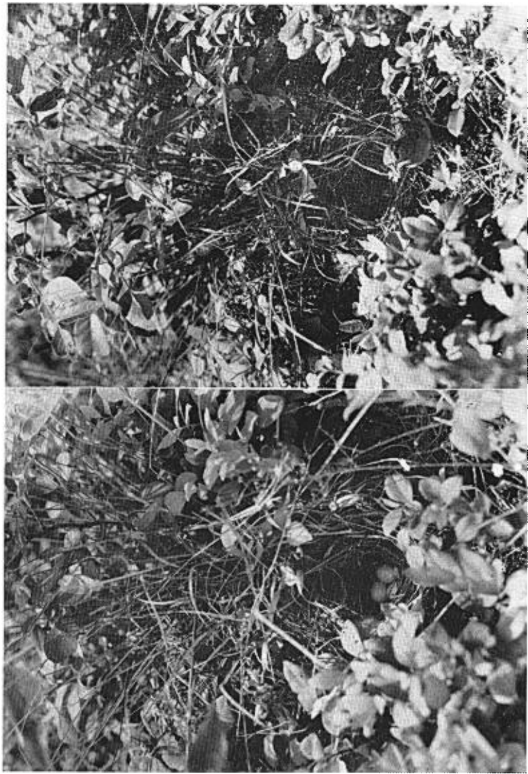
STEWART AND MEANLEY: BACHMAN'S SPARROW IN MARYLAND. (Left) Nest and eggs. (Right) Nest and adult arriving with food for the young.