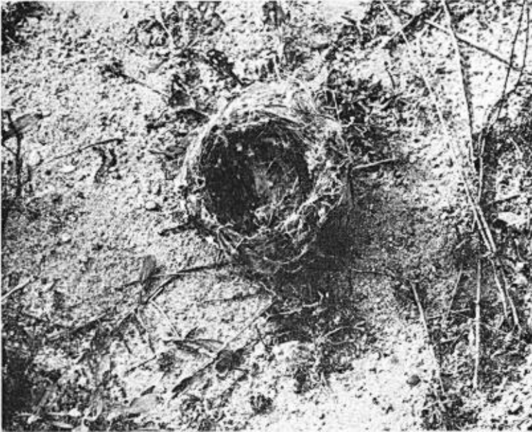
LINDSKA: COOPER'S HAWK CARRYING A NEST OF YOUNG GOLDFINCHES (right figure). Nest with a few scattered feathers.