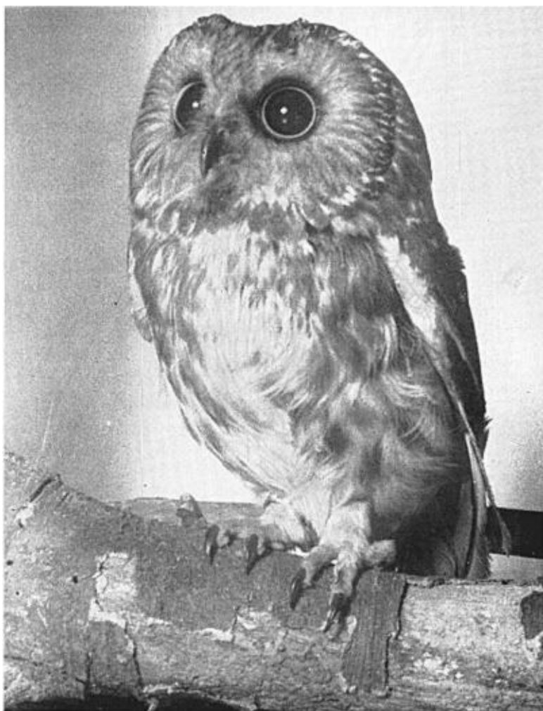
LASKEY: SAW-WHET OWL IN TENNESSEE