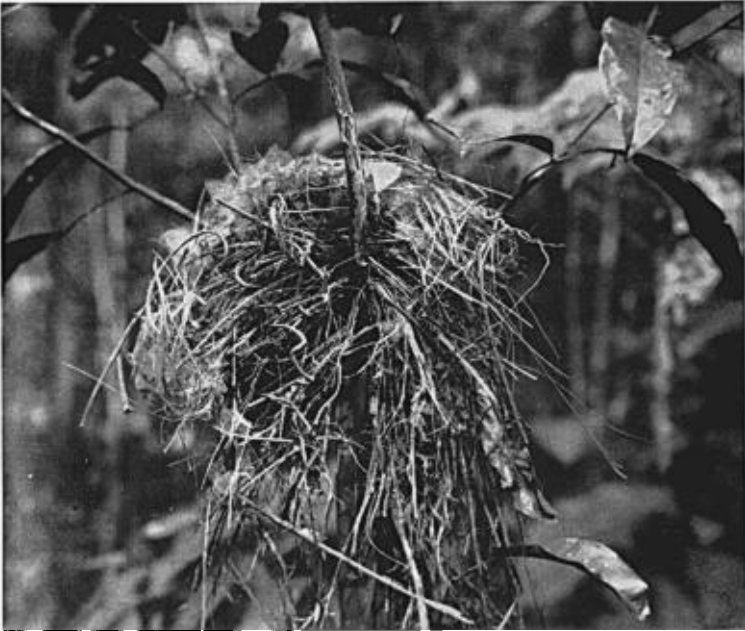
DORMITORY NEST OF LAWRENCE'S MUSICIAN WREN