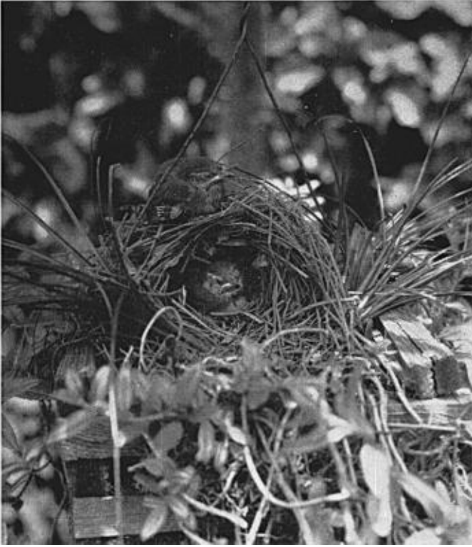
NEST OF SPOTTED-BREASTED WREN