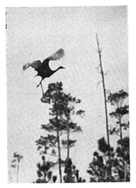
FLORIDA CRANE IN FLIGHT