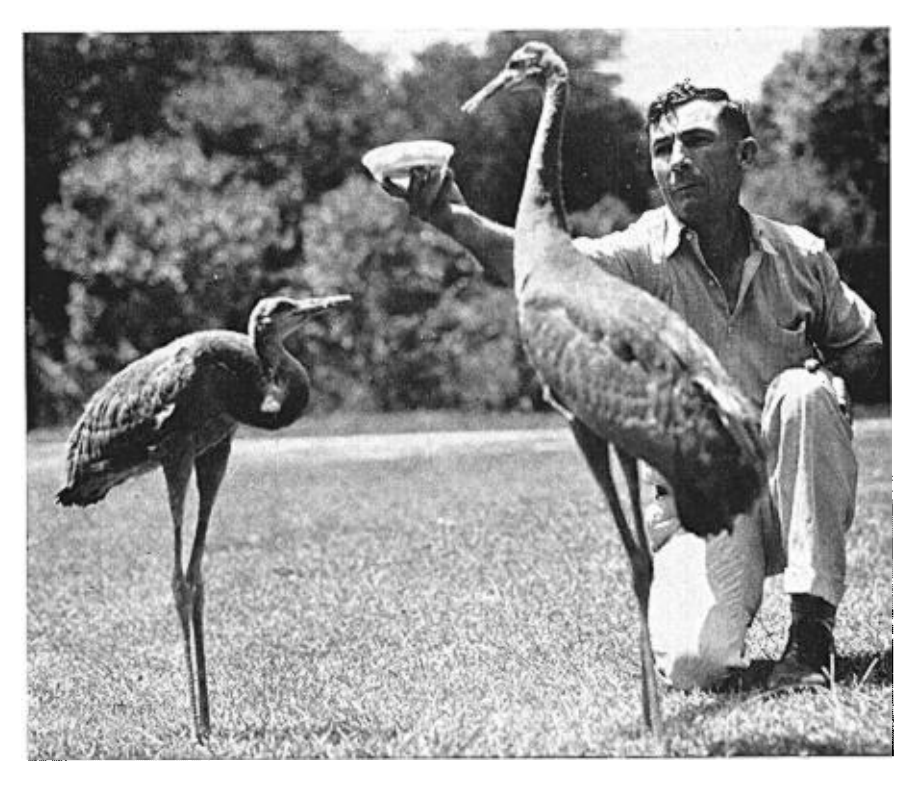
Young Florida Cranes at sixty-one and sixty-six days