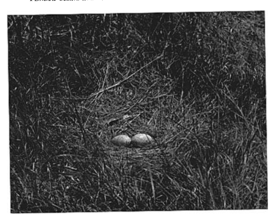
NEST OF FLORIDA CRANE IN MISSISSIPPI