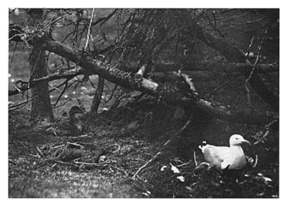
NESTS OF TWO EIDERS, A HERRING GULL, AND LEACH'S PETREL