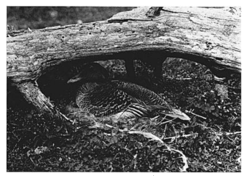
EIDER NESTING BENEATH A FALLEN SPRUCE.