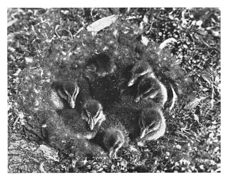
SEVEN YOUNG EIDERS LESS THAN A DAY OLD