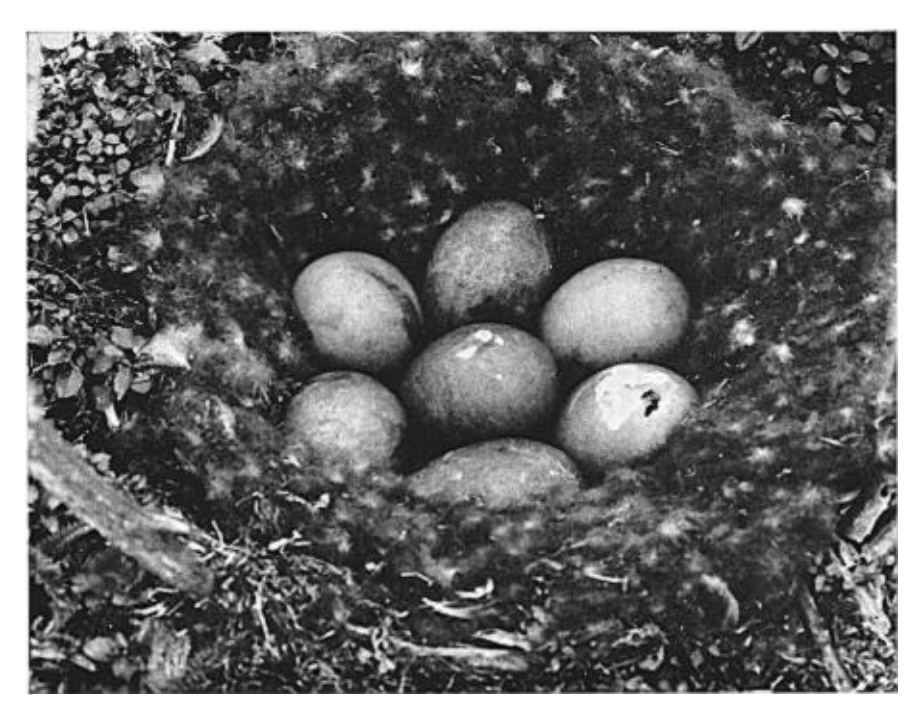
NEST OF AMERICAN EIDER WITH SEVEN EGGS