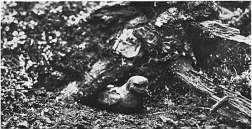
UPPER. PETRELS HOVERING IN SEARCH FOR FOOD. MIDDLE. STUMP PROVIDES PROTECTION FOR BURROWS. LOWER. FLASHLIGHT PHOTO OF PETREL LEAVING BURROW AT NIGHT.