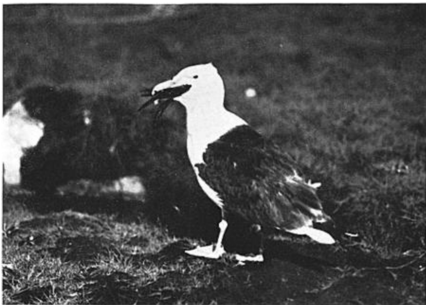
UPPER. STUMP, IN CENTER, WITH FOUR PETREL BURROWS. NESTS OF HERRING GULL AND AMERICAN EIDER ON EITHER SIDE. LOWER. THIS BLACK BACKED GULL SWALLOWED FOUR PETRELS IN TWENTY MINUTES.