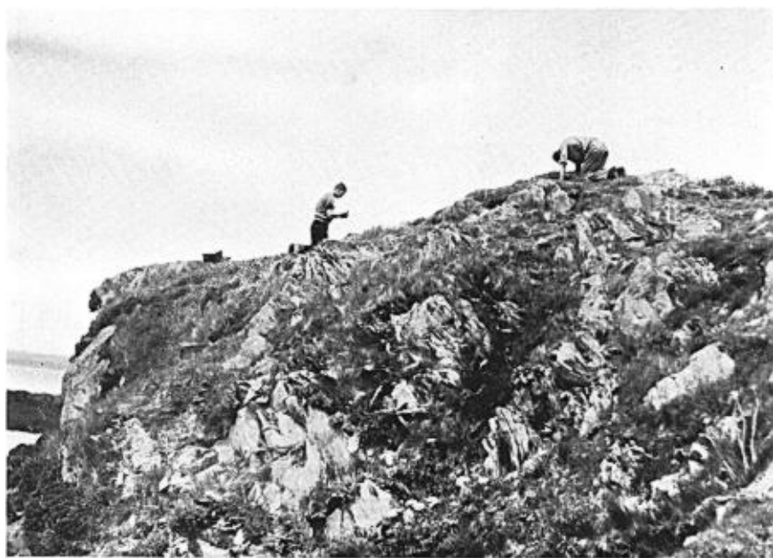
UPPER. LEACH'S PETREL COLONY. THOUSANDS OF BURROWS AMONG THE ROOTS AND BRUSH OF THE CLEARING.