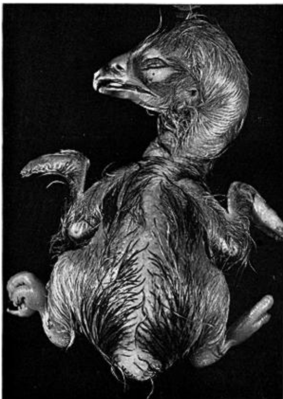
YOUNG EAGLE WHEN CLOSE TO HATCHING POINT. Upper : BEFORE, AND lower : AFTER, REMOVAL FROM THE SHELL.