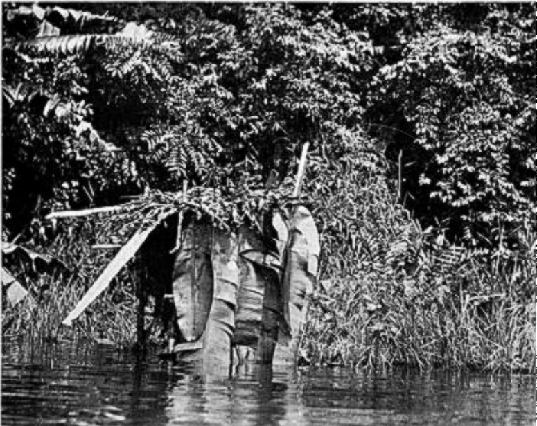
UPPER.—YOUNG PURPLE GALLINULES POSED IN NEST AFTER FOURTH EGG HAD HATCHED. AUGUST 4, 1925.