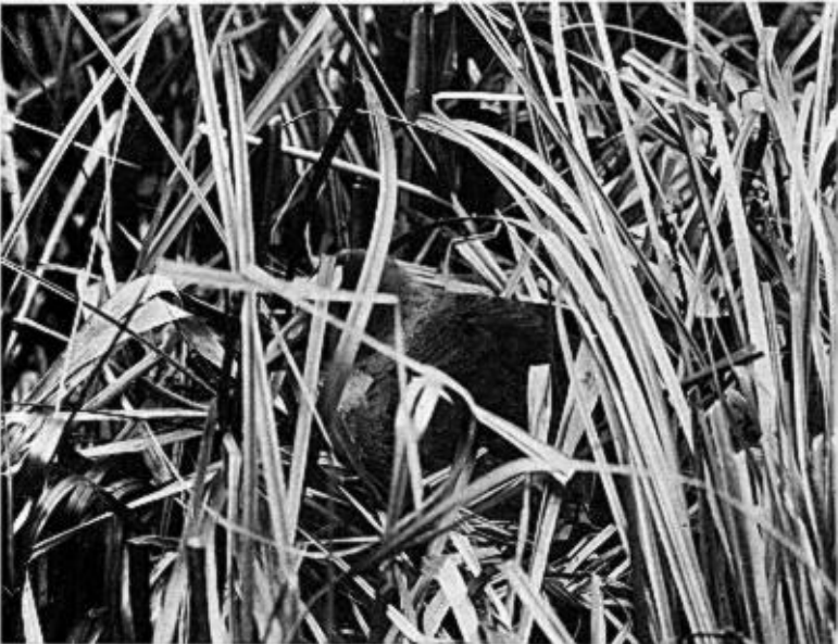
UPPER.—PURPLR GALLINULE PROTECTING HER EGGS FROM HEAT OF TROPICAL SUN. CONTROLLING TEMPERATURE BY RAPID RESPIRATION. JULY 25. LOWER.—INCUBATING EGGS, AS SEEN THROUGH TALL GRASS. JULY 24.