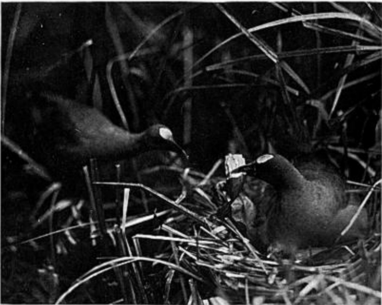
UPPER.—PURPLE GALLINULE ON LOWER SUBMERGED PART OF RUNWAY. LONG TOES AND NAILS ADMIRABLY ADAPTED TO WALKING OVER SUCH SPOTS. LOWER.—ADULT PRESENTING PIECE OF PALM LEAF TO MATE WHICH SHE HAD ATTEMPTED TO FEED TO YOUNG. NOTE NEWLY HATCHED YOUNG IN FRONT OF BREAST.