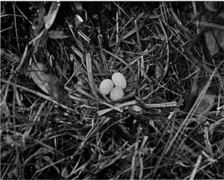
UPPER.—PURPLE GALLINULE ( Isonornis martinicus ) INCUBATING HER EGGS.

SHANNON COVE, BARRO COLORADO ISLAND, JULY 28, 1925.