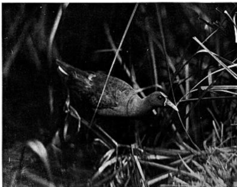
UPPER.—PURPLE GALLINULE APPROACHES NEST WITHOUT FOOD. YOUNG JUMP UP TO GRASP BILL. LOWER.—PAUSES TO INSPECT BLIND BEFORE GOING TO NEST.